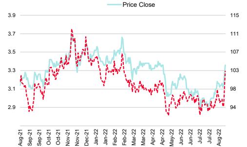
WHA Corp (WHA TB)

• มุมมองของเรา เราคิดว่าฝ่ายบริหารปรับเพิ่มเป้าหมายยอดขายที่ดินอุตสาหกรรม FY65 เนื่องจาก i) ยอดขายที่ดินอุตสาหกรรม 2Q65 เติบโตแข็งแกร่งเป็น 477 ไร่ จาก 36 ไร่ ใน 1Q65 ซึ่งส่งผลให้ยอดขายที่ดินอุตสาหกรรม 6M65 อยู่ที่ 513 ไร่ เพิ่มขึ้น +86% YoY และ ii) ความเป็นไปได้ของตลาดขนาดใหญ่กับผู้ผลิต EV จีน BYD (1211 HK, NR) ที่สนใจซื้อที่ดินอุตสาหกรรมแปลงใหญ่ภายในเดือนกันยายน ฝ่ายบริหารคาดว่ากำไรไหลเข้าของ FDI จากลูกค้าใหม่ ๆ จะเร่งขึ้นใน 2H65 โดยเฉพาะในธุรกิจที่เกี่ยวข้องกับ EV ทั้งนี้ การลงทุนมูลค่าราว 17.9 พันล้านบาทของ BYD สำหรับการผลิตรถประเภท battery EV (BEVs) และ plug-in hybrid EV (PHEVs) ได้รับอนุญาตจากคณะกรรมการส่งเสริมการลงทุน (BOI) ของไทยแล้วเมื่อวันที่ 17 ส.ค. 2565 แม้ว่าภาพรวมค่าขอรับการส่งเสริมการลงทุนจาก BOI ของทั้งประเทศลดลง 42% YoY ใน 1H65 แต่การลงทุนในธุรกิจ EV และดิจิทัลเร่งตัวสูง โดยมูลค่าลงทุนเพิ่มขึ้น 212% YoY เป็น 42.4 พันล้านบาทสำหรับ EV และเพิ่มขึ้น 202% YoY สำหรับดิจิทัลเป็น 1.45 พันล้านบาทใน 1H65