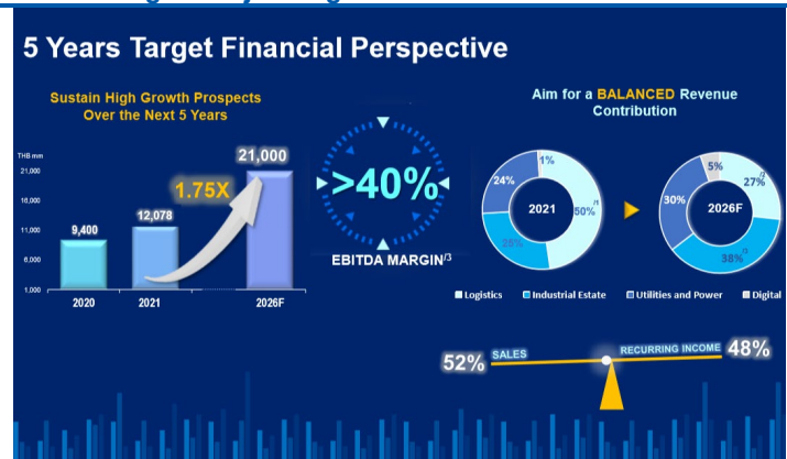
Figure 2: Balancing revenue from diversified sources while maintaining its major long-term focus