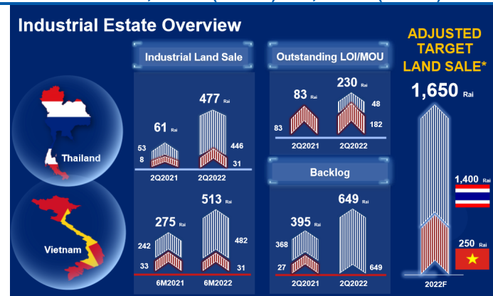
Figure 1: Management revise up FY22 target of industrial land sales from 1,250-rai (200-ha) to 1,650-rai (264-ha)