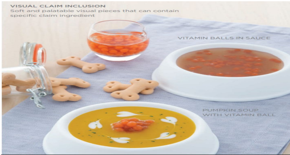
Figure 1: ITC's innovative and high quality pet food products