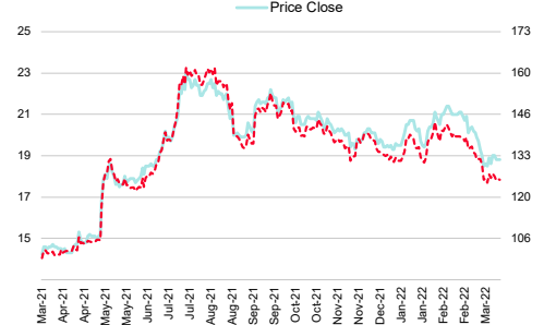
Thai Union Group (TU TB)