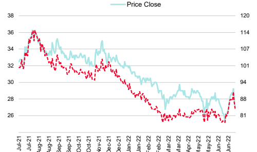
TOA Paint (TOA TB)