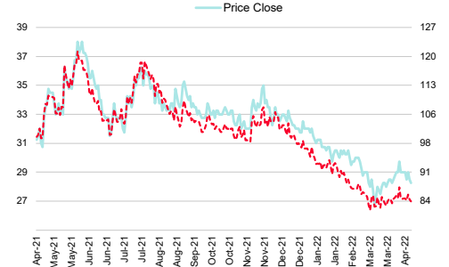
TOA Paint (TOA TB)