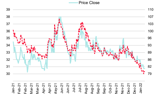
TOA Paint (TOA TB)