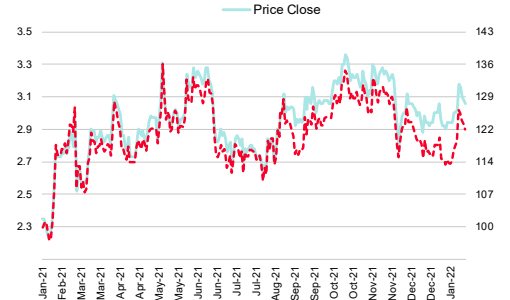
The Erawan Group (ERW TB)