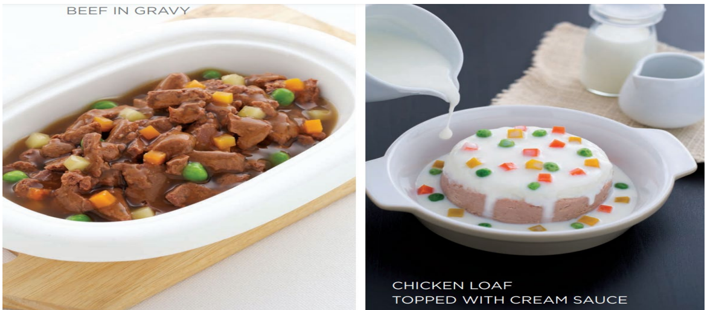
Figure 2: Innovative and premium petcare products from i-Tail