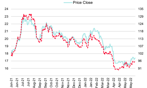
Thai Union Group (TU TB)