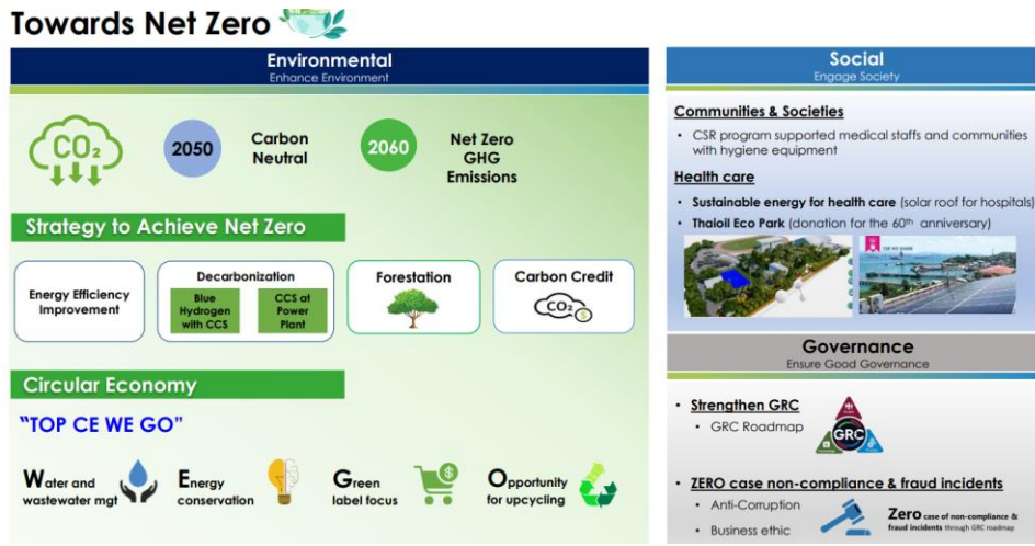
Figure 1: Capturing the future trend of green manufacturers