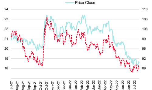
Supalai (SPALI TB)