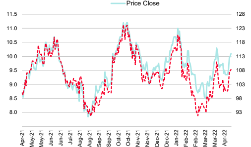
Star Petroleum Refining PCL (SPRC TB)