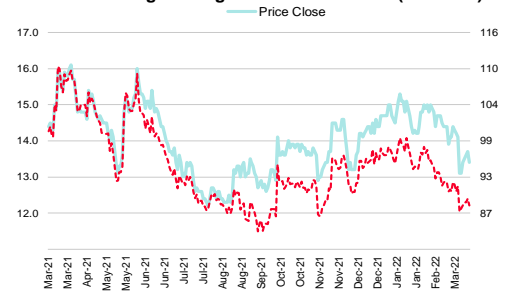
Sino Thai Engineering & Construction Plc (STEC TB)