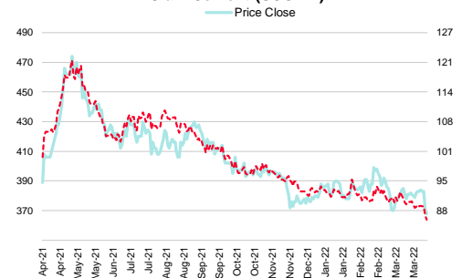
Siam Cement (SCC TB)