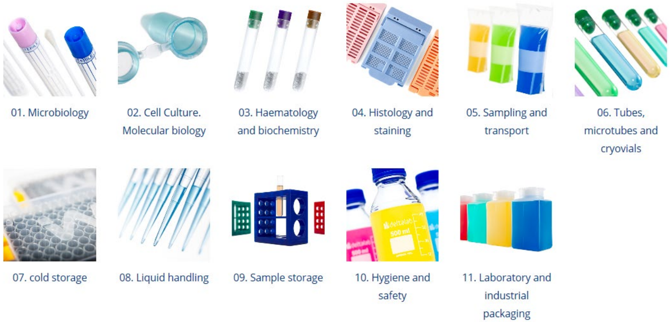
Figure 1: Deltalab's product segment under the healthcare and medical supply business