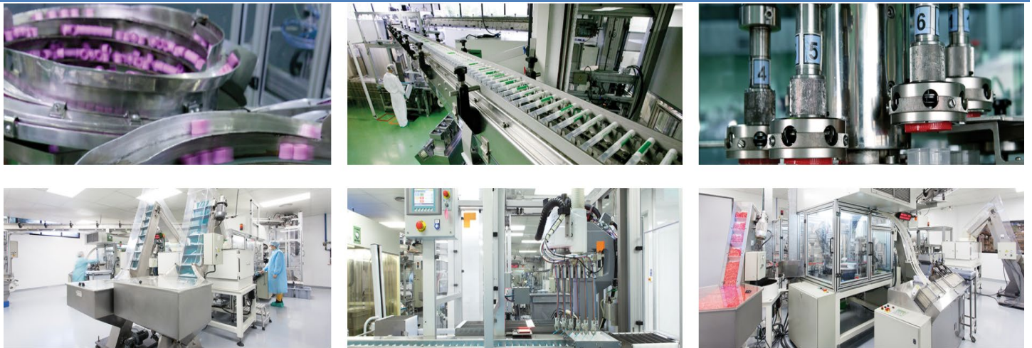
Figure 2: Deltalab's laboratory and production facilities in Spain