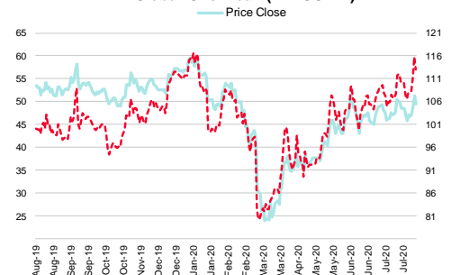
PTT Global Chemical (PTTGC TB)