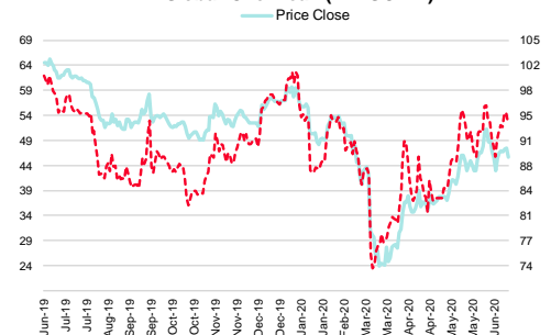
PTT Global Chemical (PTTGC TB)