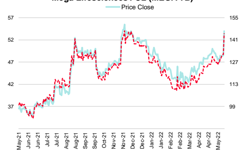
Mega Lifesciences PCL (MEGA TB)