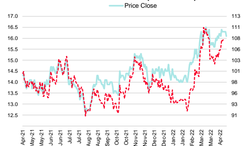
Home Product Center (HMPRO TB)