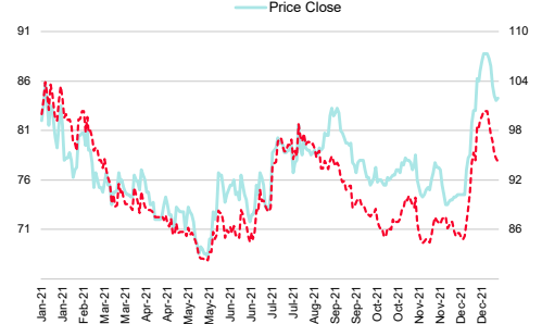
Global Power Synergy (GPSC TB)