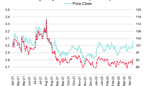
Dynasty Ceramic PCL (DCC TB)