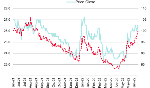
Charoen Pokphand Foods (CPF TB)