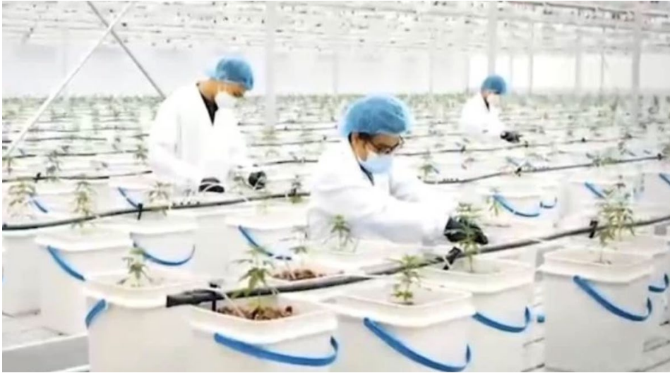
Figure 1: Entering the valuable hemp food chain