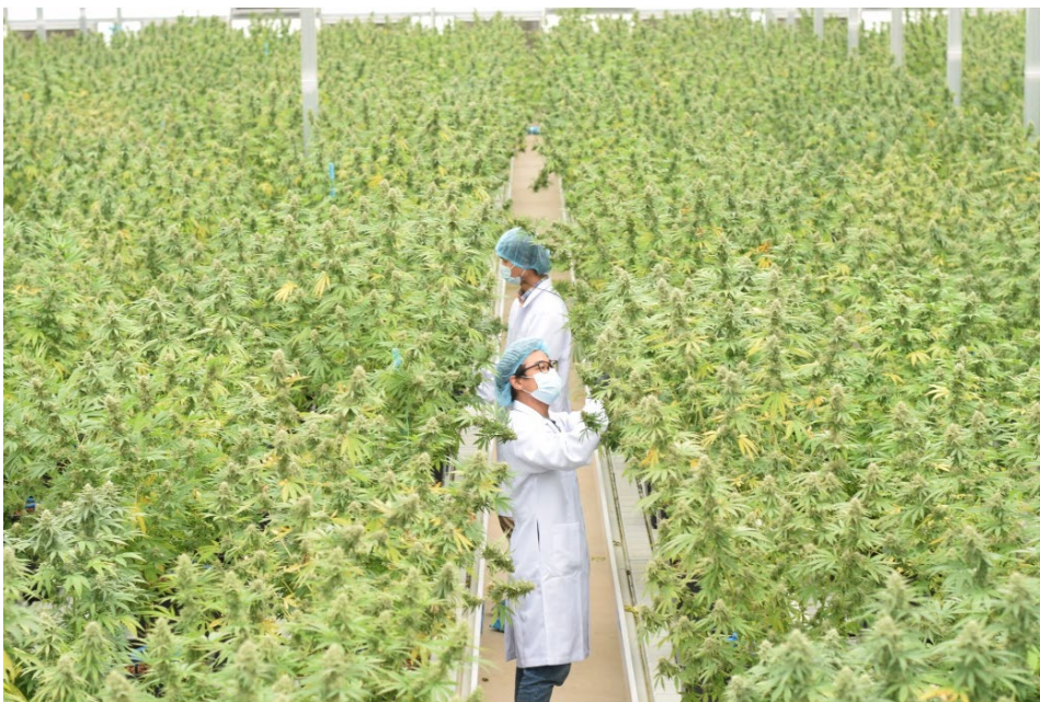
Figure 2: Unlike normal farmers/rivals, CPF and its partners can cultivate hemp indoors and control aspects like nutrients, air, and ambient light