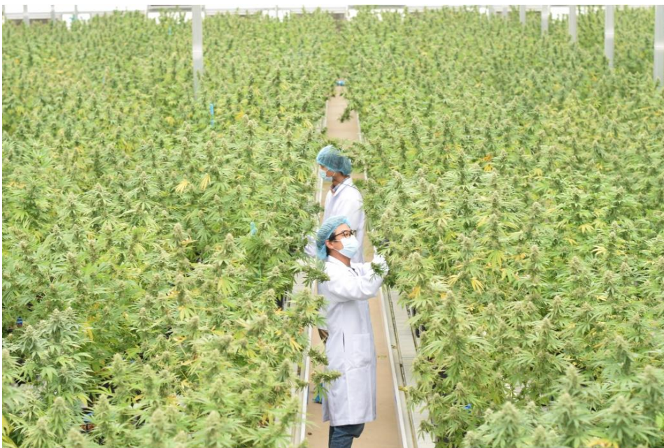
Figure 2: Unlike normal farmers/rivals, CPF and its partners can cultivate hemp indoors and control aspects like nutrients, air, and ambient light