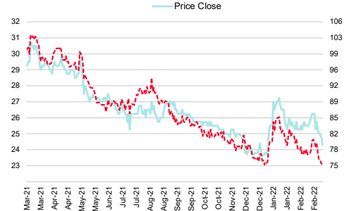
Charoen Pokphand Foods (CPF TB)