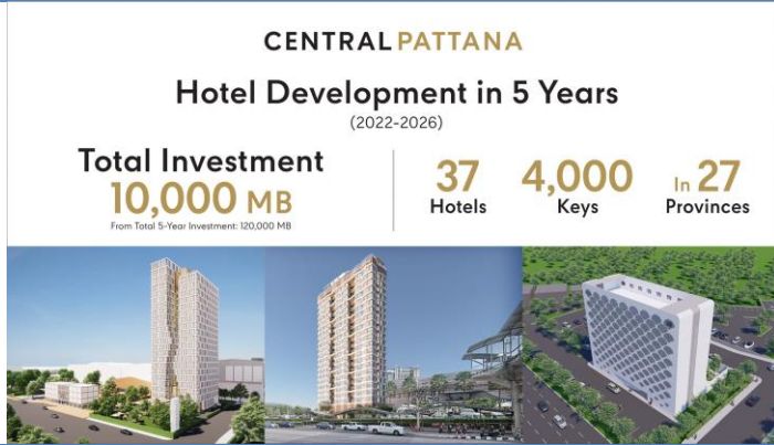
Figure 1: CPN's 5-year hotel development plan