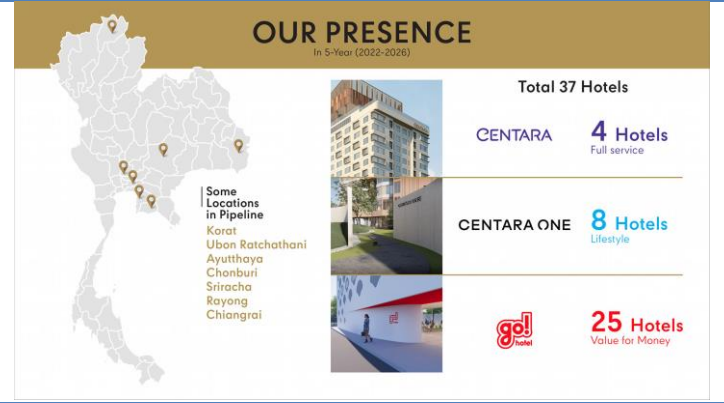
Figure 2: CENTEL's targeted managed hotels for CPN