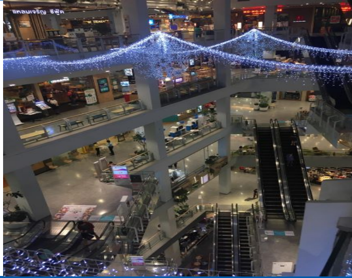
Figure 1: Weak customer traffic at Central Plaza Rama 3, a CPN mall in Bangkok, due to concerns over the spread of a second COVID-19 wave (5 Jan at 6pm)