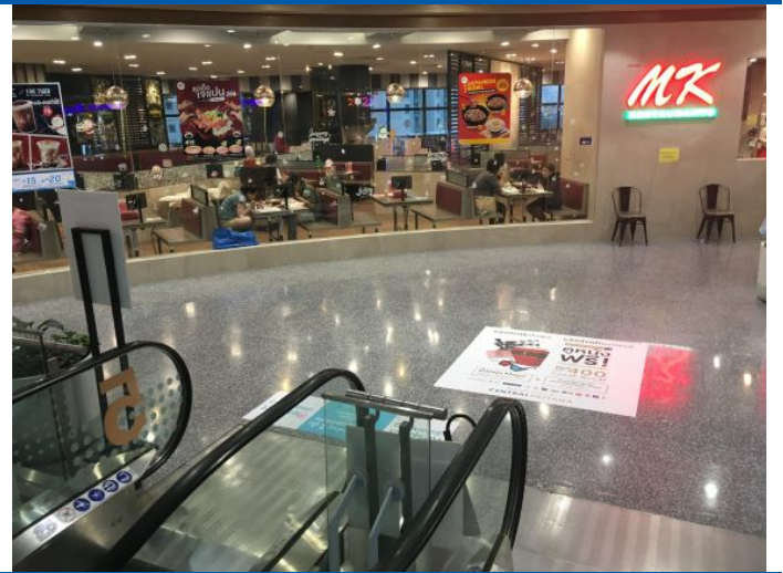
Figure 4: Intensive social distancing measures halved seating capacity at restaurants (5 Jan at 6pm)