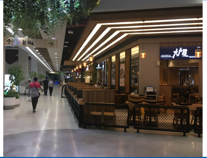
Figure 2: Unlively dining venue (5 Jan at 6pm)