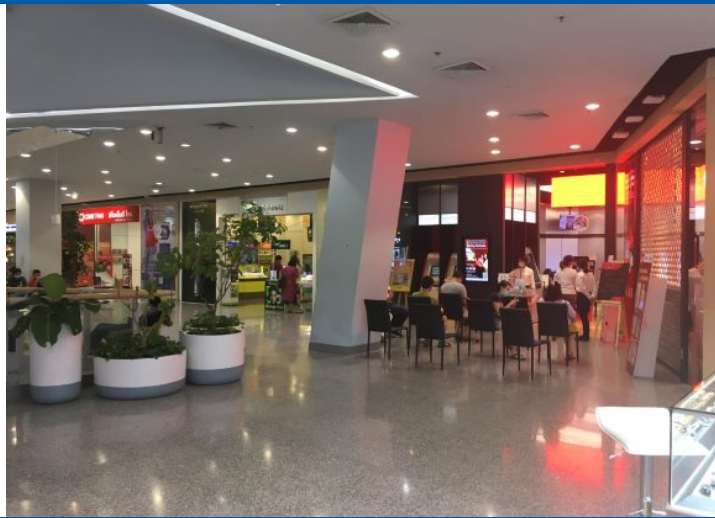
Figure 3: Services tenants applied restricted social distancing measures to control the number of customers inside their outlets (5 Jan at 5pm)