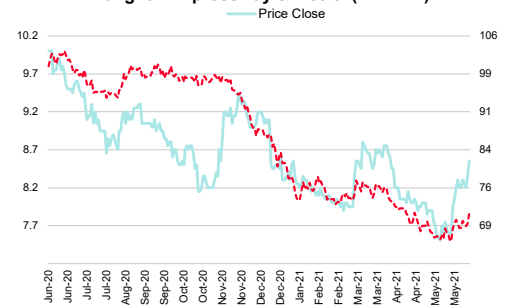
Bangkok Expressway & Metro (BEM TB)