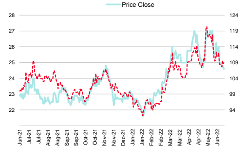
Bangkok Dusit Medical (BDMS TB)