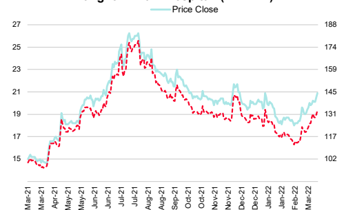
Bangkok Chain Hospital (BCH TB)