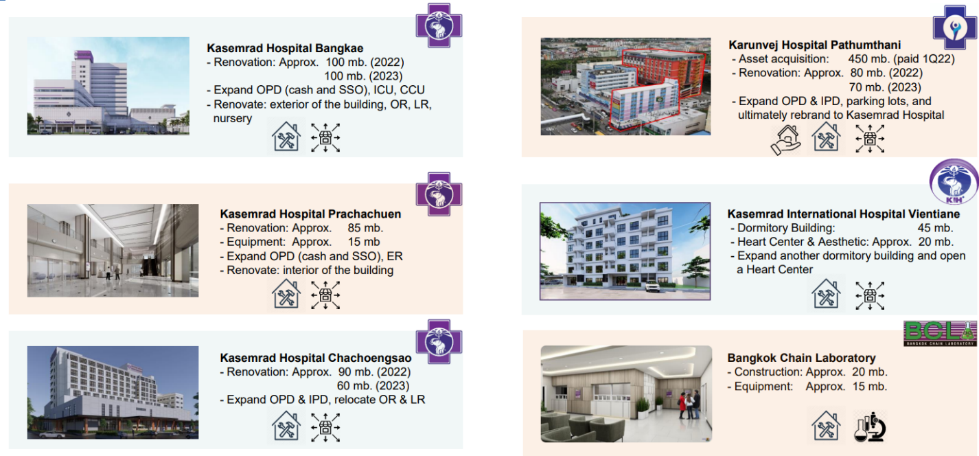
Figure 4: BCH's major investment projects in 2022