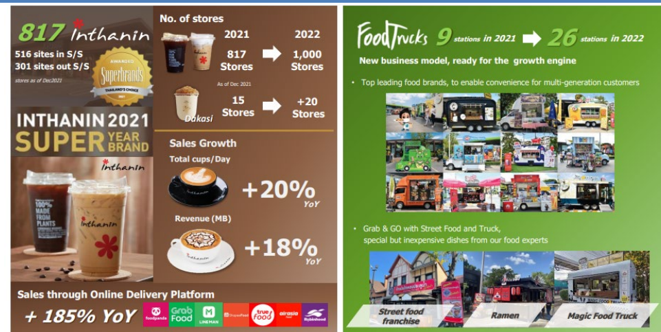
Figure 2: Continuously introducing more product choices at its oil stations