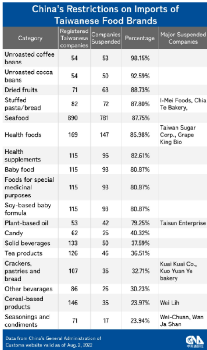
Figure 1: Taiwanese food products are banned from China