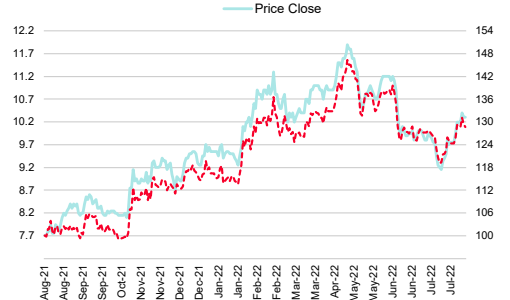
AP Thailand PCL (AP TB)