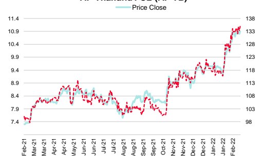
AP Thailand PCL (AP TB)