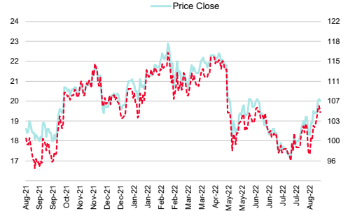
Amata Corporation (AMATA TB)