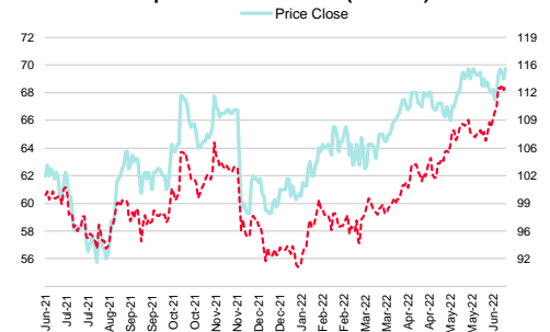
Airport of Thailand PCL (AOT TB)