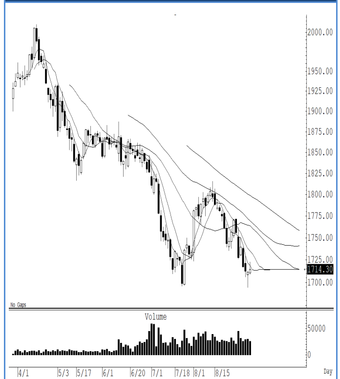
GOU22 (Close 1,714.30 Chg 3.0)

ราคาทองคำโลกเริ่มฟื้นในระยะสั้น สั้น ๆ ไม่ต่ำกว่าแนวรับแถว ๆ 1,685 ดอลลาร์ แนะนำ trading ในกรอบระหว่าง 1,685-1,735 ดอลลาร์ ระวังถ้าไร หรือในกรณีที่ปิดต่ำกว่าระดับ 1,675 ดอลลาร์ แนะนำ ถือ short หวังผลปรับตัวลงไปแถว ๆ 1,650 ดอลลาร์ ระวังถ้าไร