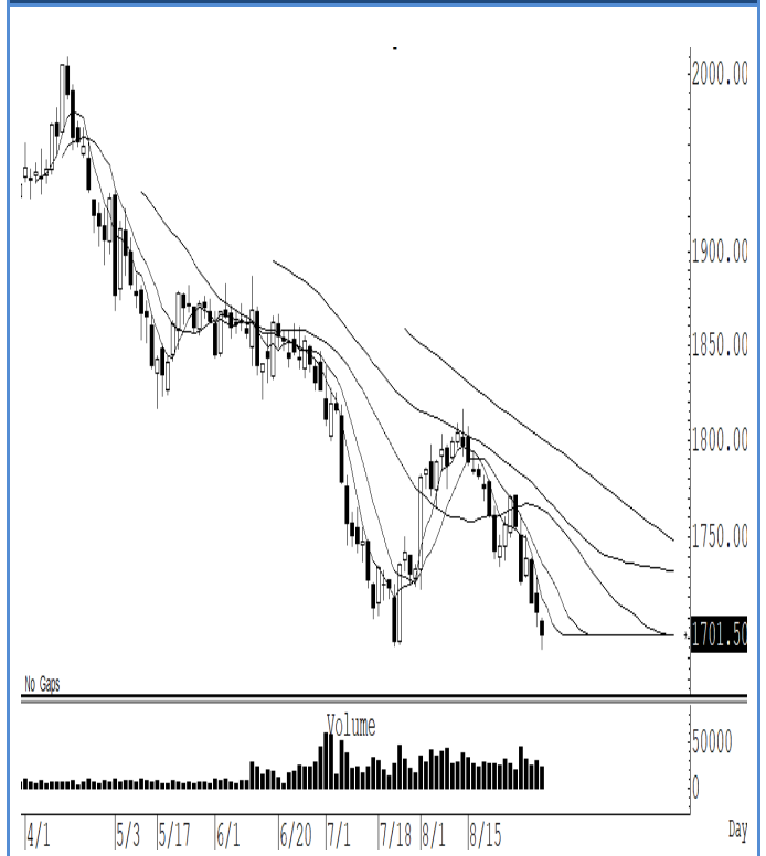
GOU22 (Close 1,701.50 Chg -11.20)

ราคาทองคำโลกอ่อนตัวลงต่อเนื่อง สั้น ๆ ตีกลับไม่ข้ามแถว ๆ 1,730 ดอลลาร์ แนะนำ trading ในกรอบระหว่าง 1,730-1,675 ดอลลาร์ ระวังถ้าไร หรือในกรณีที่ปิดต่ำกว่าระดับ 1,675 ดอลลาร์ แนะนำ ถือ short หวังผลปรับตัวลงไปแถว ๆ 1,650 ดอลลาร์ ระวังถ้าไร