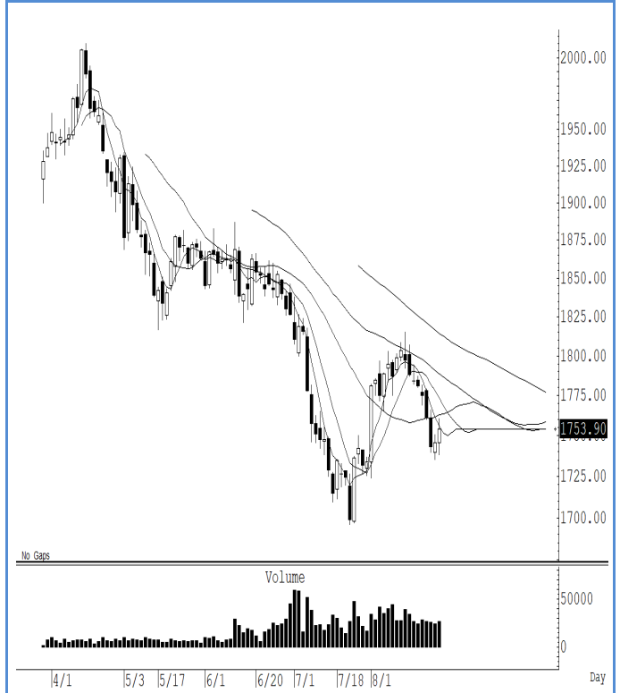
GOU22 (Close 1,753.90 Chg 8.10)

ราคาทองคำโลกฟื้นตัวเล็กน้อย สั้น ๆ ติดกลับไม่ข้าม 1,760 ดอลลาร์ แนะนำ trading ในกรอบระหว่าง 1,760-1,710 ดอลลาร์ รับรู้กำไร หรือในกรณีที่ปิดต่ำกว่าระดับ 1,710 ดอลลาร์ แนะนำ ถือ short หวังผลปรับตัวลงไปแถว ๆ 1,680 ดอลลาร์ รับรู้กำไร