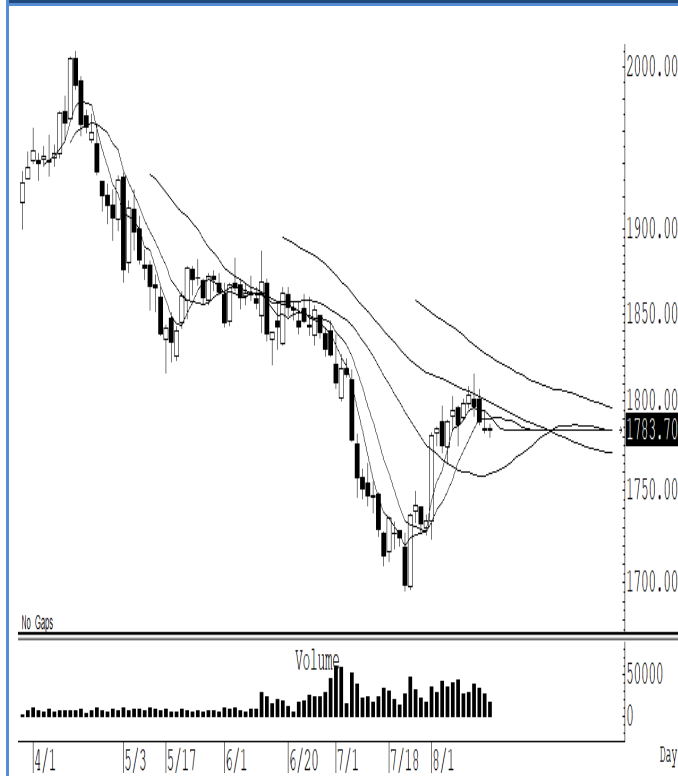
GOU22 (Close 1,783.70 Chg -0.60)

ราคาทองคำโลกแกว่งออกด้านข้าง สั้น ๆ ไม่ข้าม 1,790 ดอลลาร์ แนะนำ trading ในกรอบระหว่าง 1,790-1,750 ดอลลาร์ ระวังกำไร หรือในกรณีที่ปิดต่ำกว่าระดับ 1,750 ดอลลาร์ แนะนำ ถือ short หวังผลปรับตัวลงไปแถว ๆ 1,700 ดอลลาร์ ระวังกำไร