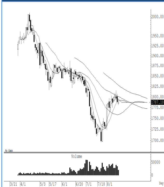
GOU22 (Close 1,787.10 Chg -1.20)

ราคาทองคำโลกไม่ผ่านแถว ๆ 1,805 ดอลลาร์ สั้น ๆ ไม่ข้าม 1,790 ดอลลาร์ แนะนำ trading ในกรอบระหว่าง 1,790-1,750 ดอลลาร์ ระวังกำไร หรือในกรณีที่ปิดต่ำกว่าระดับ 1,750 ดอลลาร์ แนะนำ ถือ short หวังผลปรับตัวลงไปแถว ๆ 1,700 ดอลลาร์ ระวังกำไร