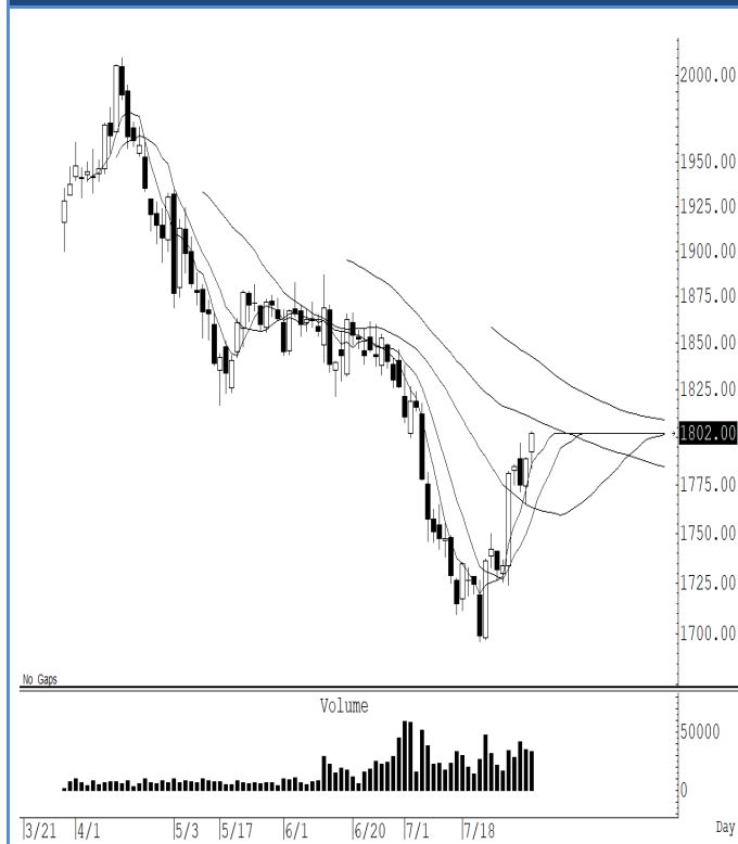
GOU22 (Close 1,802.00 Chg 13.30)

ราคาทองคำโลกปรับตัวขึ้นต่อ สั้น ๆ ไม่ต่ำกว่าแถว ๆ 1,780 ดอลลาร์ แนะนำ trading ในกรอบระหว่าง 1,780-1,810 ดอลลาร์ ระวังกำไร หรือในกรณีที่ปิดต่ำกว่าระดับ 1,760 ดอลลาร์ แนะนำ ถือ short หวังผลปรับตัวลงไปแถว ๆ 1,700 ดอลลาร์ ระวังกำไร