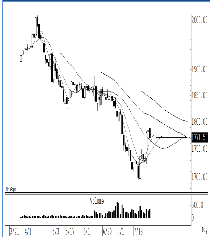
GOU22 (Close 1,771.50 Chg -13.00)

ราคาทองคำโลกเริ่มย่อตัวลง สั้น ๆ ไม่ข้ามแถว ๆ 1,775 ดอลลาร์ แนะนำ trading ในกรอบระหว่าง 1,775-1,740 ดอลลาร์ รับรู้กำไร หรือในกรณีที่ปิดต่ำกว่าระดับ 1,735 ดอลลาร์ แนะนำ ถือ short หวังผลปรับตัวลงไปแถว ๆ 1,700 ดอลลาร์ รับรู้กำไร