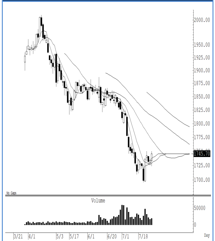
GOU22 (Close 1,745.70 Chg 11.90)

ราคาทองคำโลกฟื้นตัวขึ้นมาต่อเนื่อง สั้น ๆ ไม่ต่ำกว่าแนวรับแถว ๆ 1,735 ดอลลาร์ แนะนำ trading ในกรอบระหว่าง 1,735-1,795 ดอลลาร์ ระวังกำไร หรือในกรณีที่ปิดต่ำกว่าระดับ 1,710 ดอลลาร์ แนะนำ ถือ short หวังผลปรับตัวลงไปแถว ๆ 1,680 ดอลลาร์ ระวังกำไร