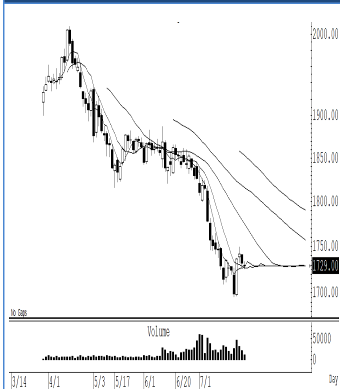
GOU22 (Close 1,729.0 Chg -2.70)

ราคาทองคำโลกแกว่งออกด้านข้าง สั้น ๆ ไม่ต่ำกว่าแนวรับแถว ๆ 1,710 ดอลลาร์ แนะนำ trading ในกรอบระหว่าง 1,710-1,750 ดอลลาร์ ระวังกำไร หรือในกรณีที่ปิดเหนือระดับ 1,755 ดอลลาร์ แนะนำ ถือ long หวังผลปรับตัวขึ้นไปแถว ๆ 1,800 ดอลลาร์ ระวังกำไร