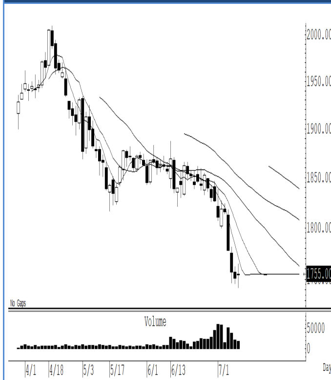
GOU22 (Close 1,755.0 Chg 4.10)

ราคาทองคำโลกแกว่งออกด้านข้าง เรามองสั้น ๆ ติดกลับไม่ข้ามแถว ๆ 1,770 ดอลลาร์ แนะนำ trading ในกรอบระหว่าง 1,770-1,730 ดอลลาร์ ระวังกำไร และในกรณีนี้ที่ปิดต่ำกว่าระดับ 1,730 ดอลลาร์อีก แนะนำ ถือ short ต่อ หวังผลปรับตัวลงไปแถว ๆ 1,680-1,650 ดอลลาร์ ระวังกำไร