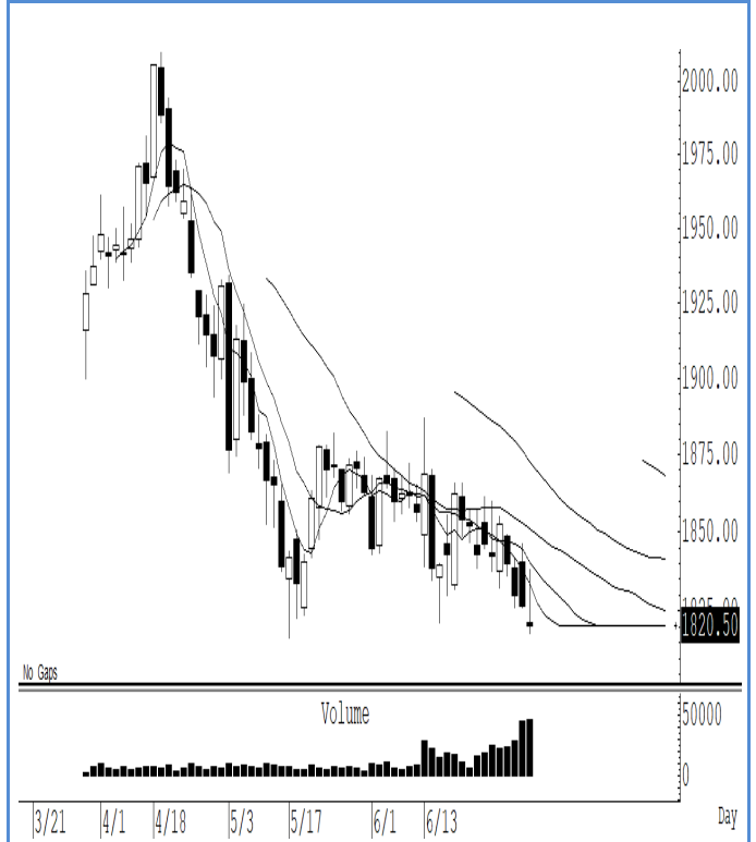
GOU22 (Close 1,820.50 Chg -6.0)

ราคาทองคำโลกแกว่งออกด้านข้าง ทิศทางในระยะสั้นยังเป็นการแกว่งใน กรอบ sideway จนกว่าจะ breakout เรามองสั้น ๆ ดึงกลับไม่ข้ามแถว ๆ 1,835 ดอลลาร์ แนะนำ short หวังผลปรับตัวลงแถว ๆ 1,790 ดอลลาร์ และในกรณีที่ปิดต่ำกว่าระดับ 1,790 ดอลลาร์อีก แนะนำ short ต่อเนื่อง หวังผลปรับตัวลงไปแถว ๆ 1,755 ดอลลาร์ ระวังกำไร