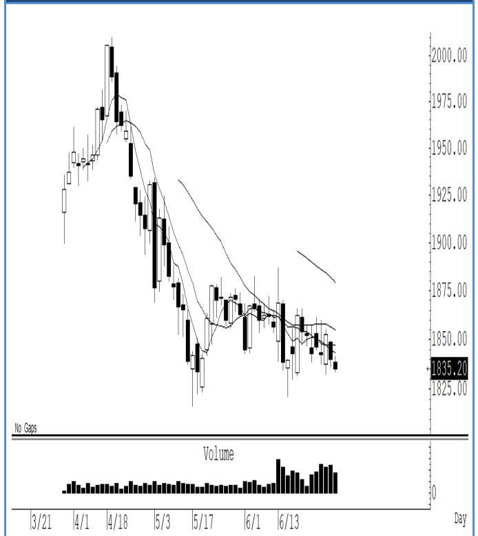
GOU22 (Close 1,835.20 Chg -4.60)

ราคาทองคำโลกแกว่งออกด้านข้าง ทิศทางในระยะสั้นยังเป็นการแกว่งในกรอบ sideway จนกว่าจะ breakout แนะนำ trading ในกรอบแถว ๆ 1,820-1,855 รับรู้กำไร ในกรณีที่ปิดต่ำกว่า 1,815 ดอลลาร์ แนะนำ ถือ short หวังผลปรับตัวลงไปแถว ๆ 1,765 ดอลลาร์ รับรู้กำไร