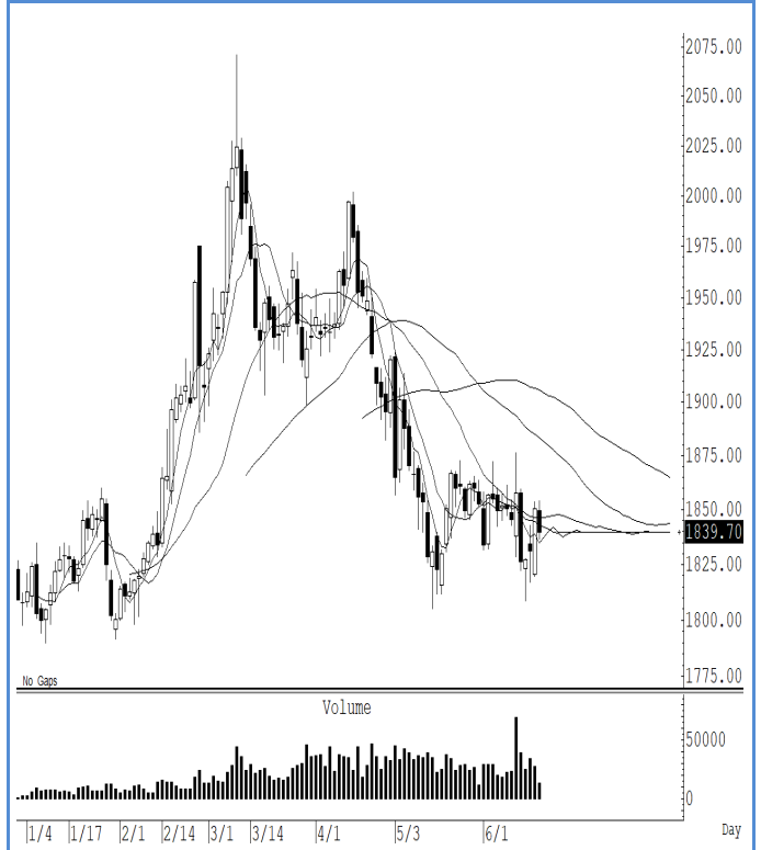
GOM22 (Close 1,839.70 Chg -10.90)

ราคาทองคำโลกแกว่งออกด้านข้าง เรามองทิศทางในระยะสั้นยังเป็นการแกว่งในกรอบ sideways จนกว่าจะ breakout แนะนำ trading ในกรอบแถว ๆ 1,825-1,870 ระวังกำไร ในกรณีที่ปิดต่ำกว่า 1,820 ดอลลาร์ แนะนำ ถือ short หวังผลปรับตัวลงไปแถว ๆ 1,780 ดอลลาร์ ระวังกำไร