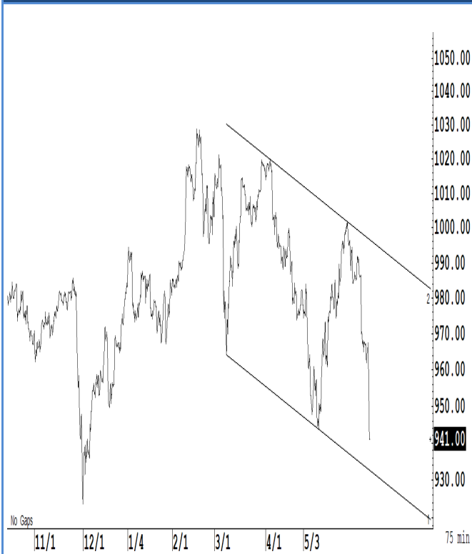
S50M22 (Close 964.90 Chg -1.90)

กำลังปรับตัวลงมาแตะ downtrend line channel ที่กรอบล่าง หรือแถว ๆ 930-920 จุด สั้น ๆ ดึงกลับไม่ข้ามแถว ๆ 953 จุด มองแนวโน้มยังเป็นขาลง แนะนำ trading ในกรอบระหว่าง 953-925 จุด ระวังกำไร