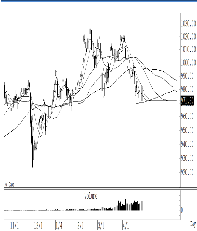
S50M22 (Close 971.80 Chg -3.30)

ยังคงแกว่งออกด้านข้าง แต่แนวโน้มค่อย ๆ ซึมลงมา สั้น ๆ ตีกลับไม่ข้าม แนวต้านแถว ๆ 980 จุด แนะนำ trading ในกรอบระหว่าง 980-950 จุด รับรู้กำไร