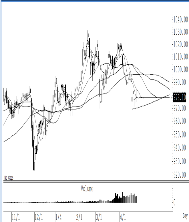
S50M22 (Close 978.10 Chg 0.20)

ยังคงติดกลับไม่ข้าม 985 จุด ทำให้ทิศทางคาดว่าจะแกว่งออกด้านข้างสั้น ๆ ไม่ข้ามแถว ๆ 985 จุด แนะนำ trading ในกรอบระหว่าง 985-970 จุด รับรู้กำไร ไม่เปิดต่ำกว่า 970 จุด ยังเก็งกำไรในกรอบ 970-980 จุดได้