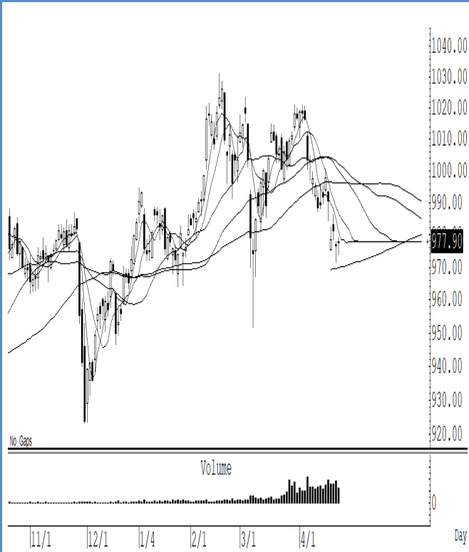
S50M22 (Close 977.90 Chg 1.20)